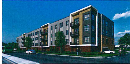
(Pictured: plans of the new Jewish Family Services affordable senior living residence, Woodale Crossing)

We are thrilled to invite you to the groundbreaking for Woodale Crossing, a free celebration which is open to all and supports residential mental and social services at Woodale Crossing.